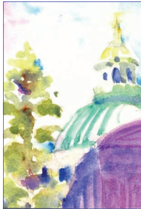
Annapolis Naval Academy Chapel