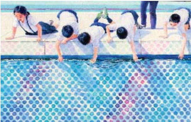
Sally Davies' "Playing with Water"

www.theartleague.org/blog/2017/07/13/sally-davies-playing-water-dots/