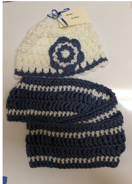
Hat and Scarf