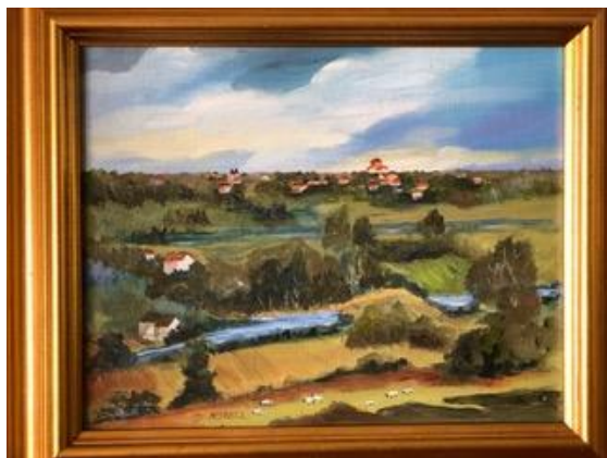
LeCour de Visa.