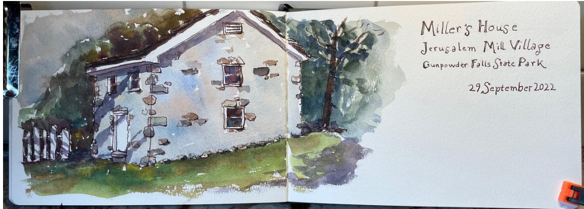
Miller's House Jerusalem Mill Village Gunpowder Falls State Park 29 September 2022