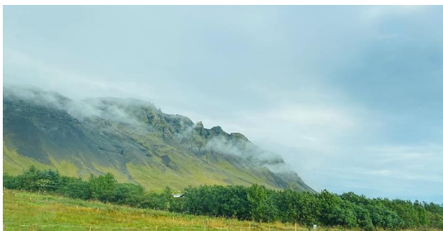
Sky Meets Earth