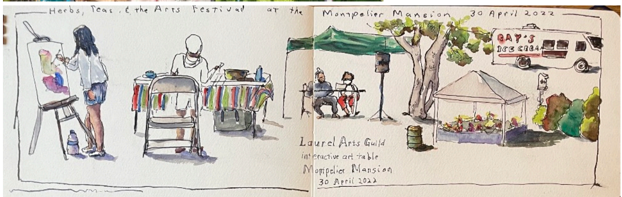
On Site Sketch by Pam Bozzi