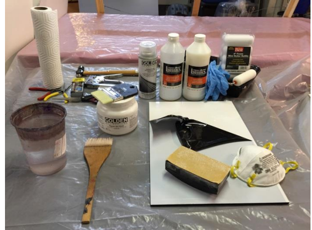
Mounting and Varnishing Supplies