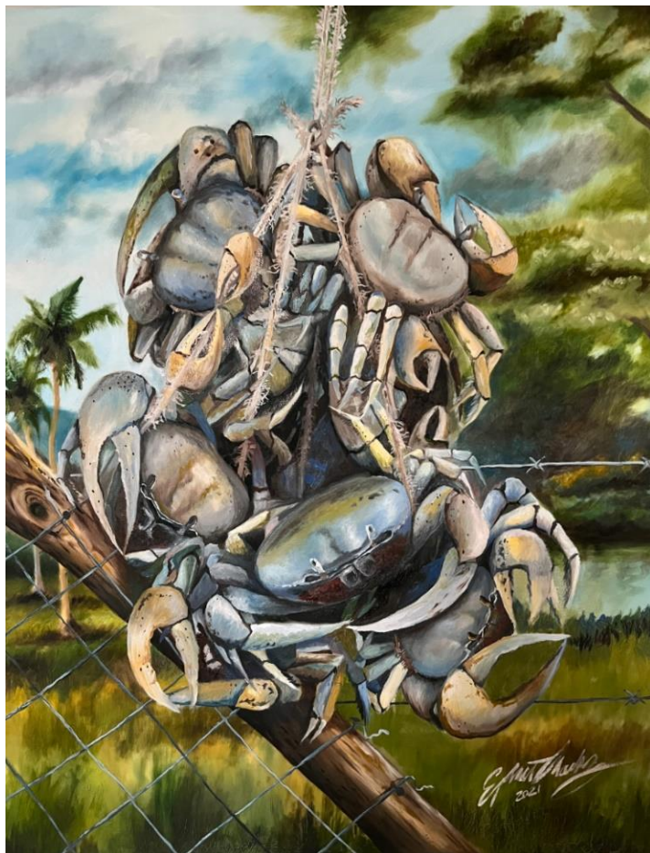
Special mention: Efrain Montanez, Caribbean Land Crabs , oil painting