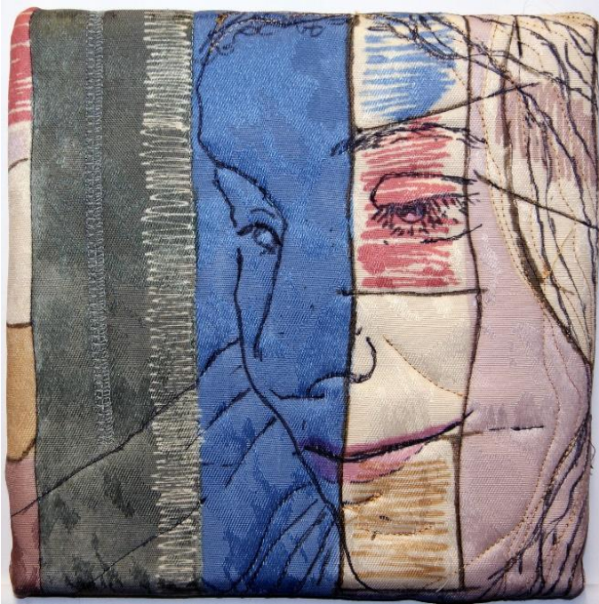
Honorable mention: Linda Bernard, Face with Blue Stripe , fiber