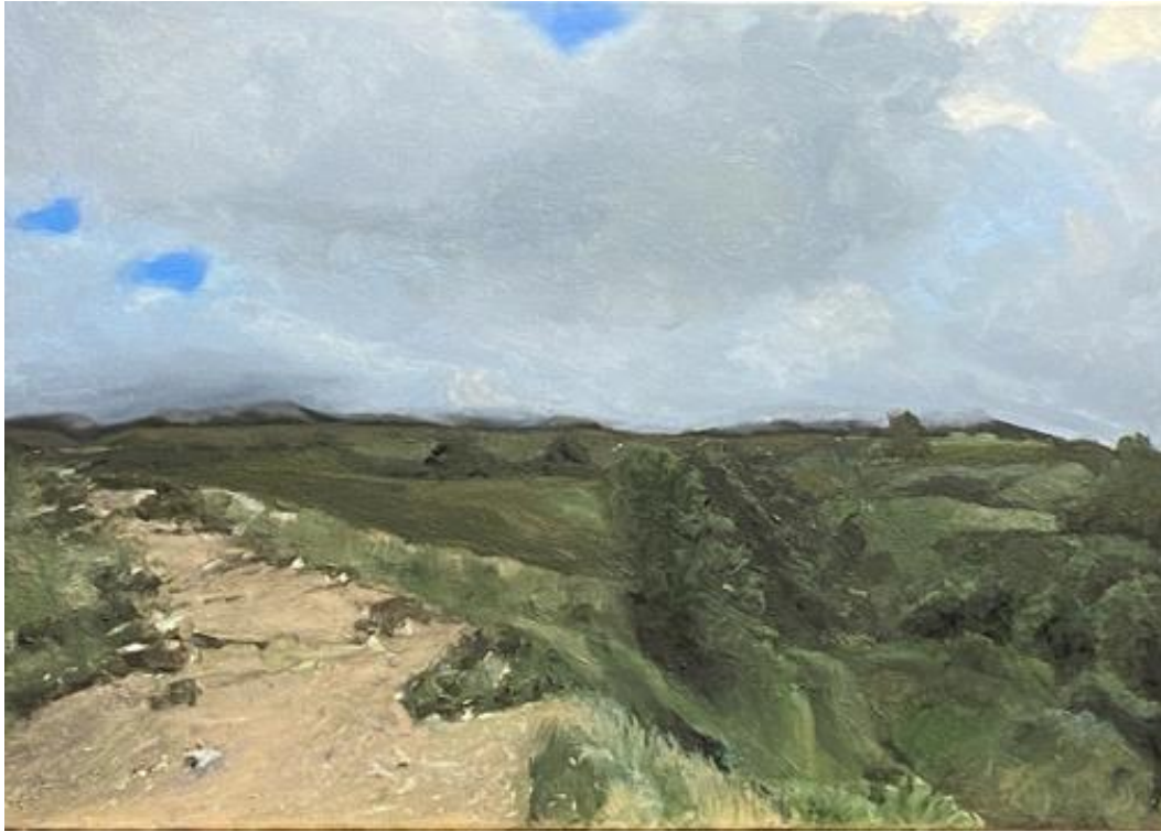
Honorable mention: Audrey Moog, Walk to Clouds , oil painting