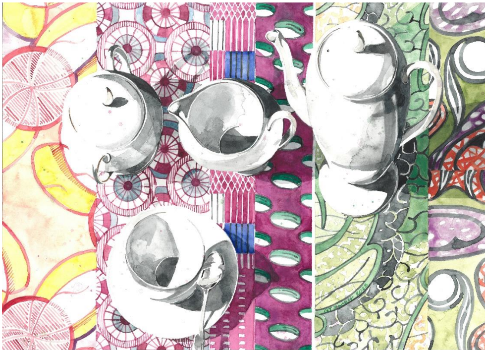
Honorable mention: Gloria Tseng Fischer, Coffee in Zimbabwe , watercolor