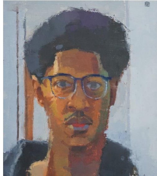
"Self Portrait 1"