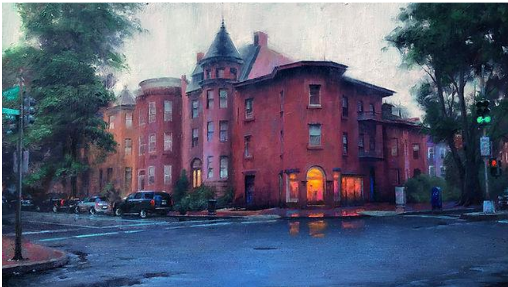
Rain on Sunday Afternoon (11th and East Capitol)