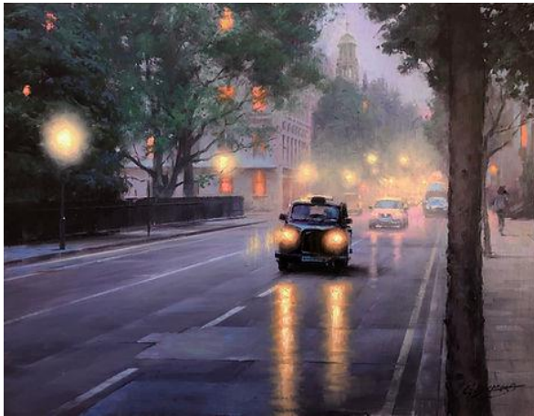
Fog on Sloan Street