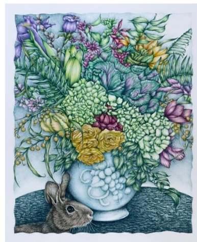
"Treasures from the Secret Garden"