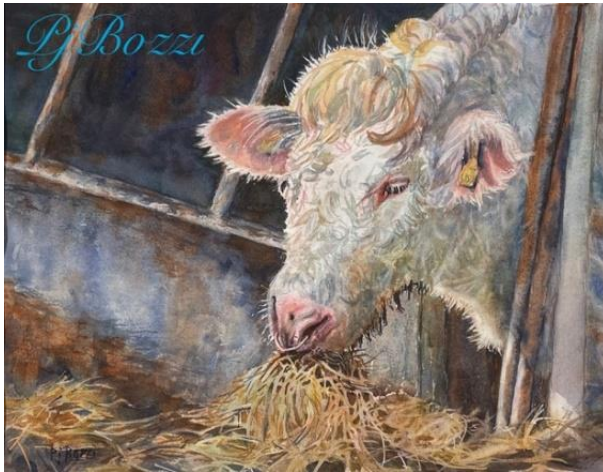
Billy the Bull