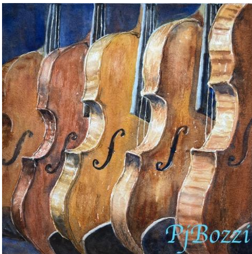
Fiddles on Display