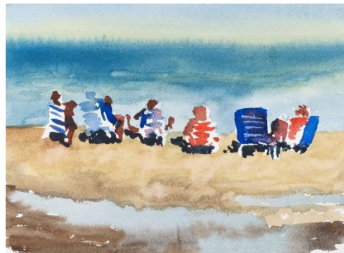
Dennis Beach Goers