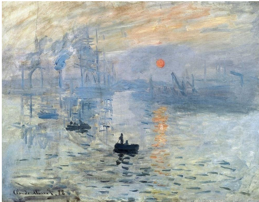
Claude Monet: Impression Sunrise

The placards along the way bring to life the national and cultural events of the day (including the Franco Prussian War) that greatly influenced the artists in their choice of subject matter. This exhibit is a “must-see” for all artists and provides great insight into the development of art in our culture as well as an inspiring and enjoyable artistic experience.