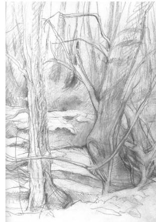
Plein air sketch at National Ice Rink with MAA artists “Trees in the Snow”